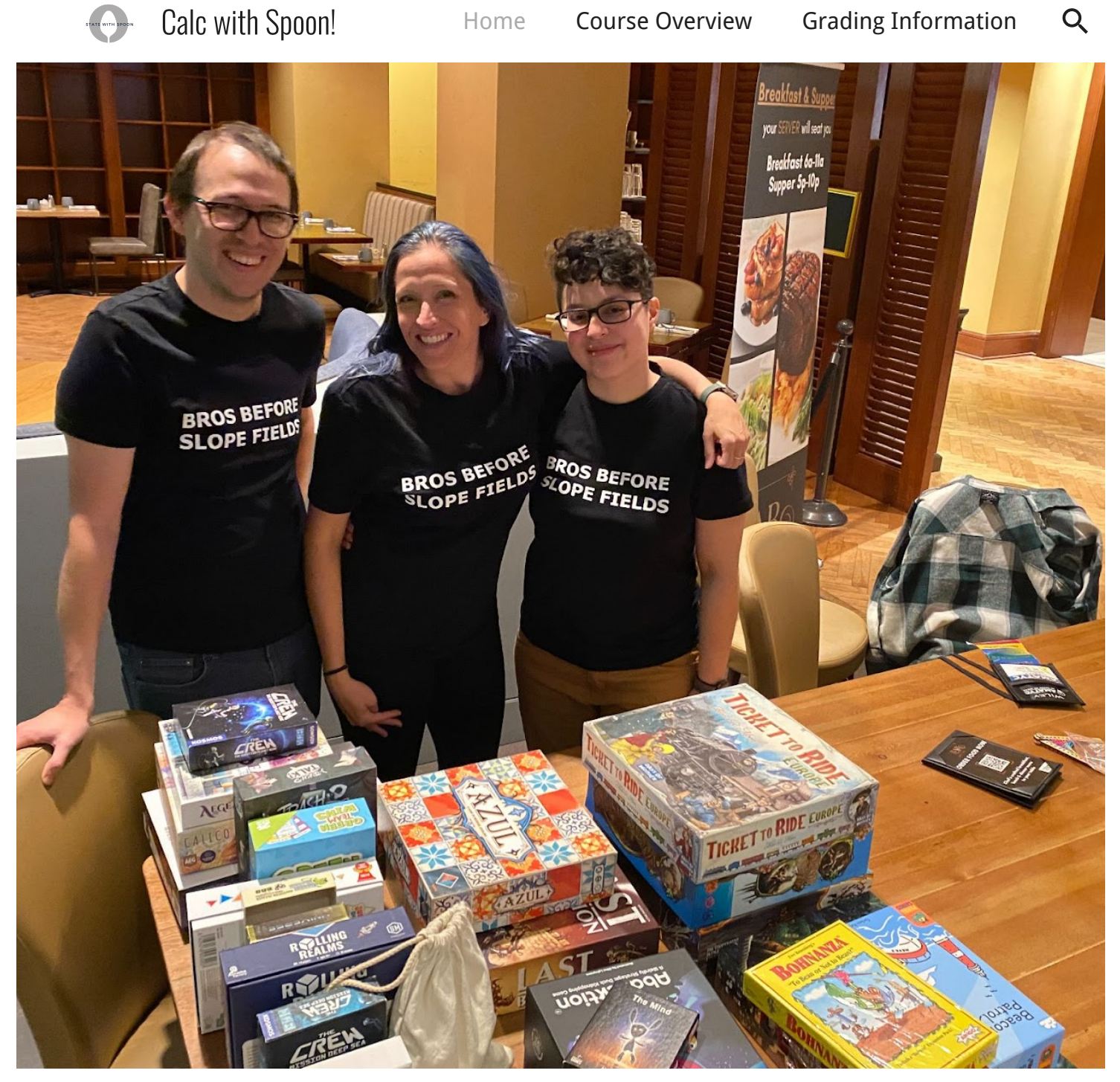
Hanging with some of my besties and a ton of board games at an annual conference for teaching math at the two year colleges.